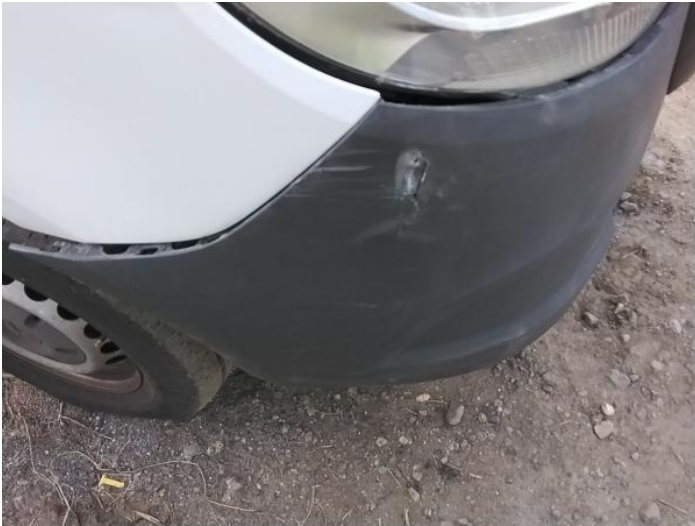
45: Bumper Front Hole Over 25mm