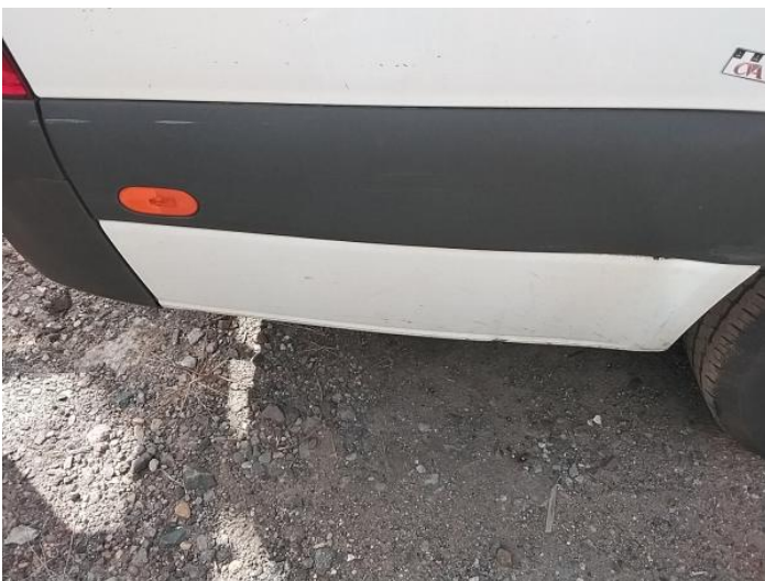
31: Qtr Panel Moulding os Scuffed (Unpainted) Over 100mm