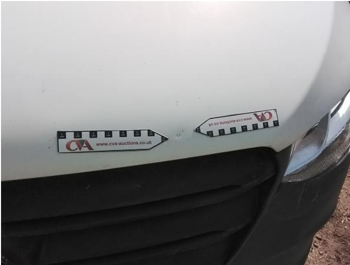
3: Bonnet Dented With Paint Damage