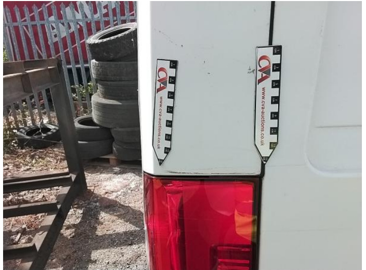
28: C Post os Scratched Over 25mm Thru Paint