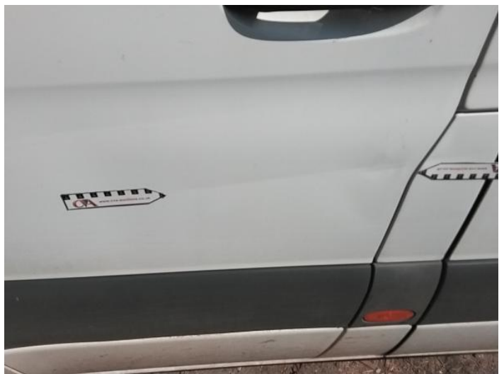
14: Door nsf Dented Over 30mm