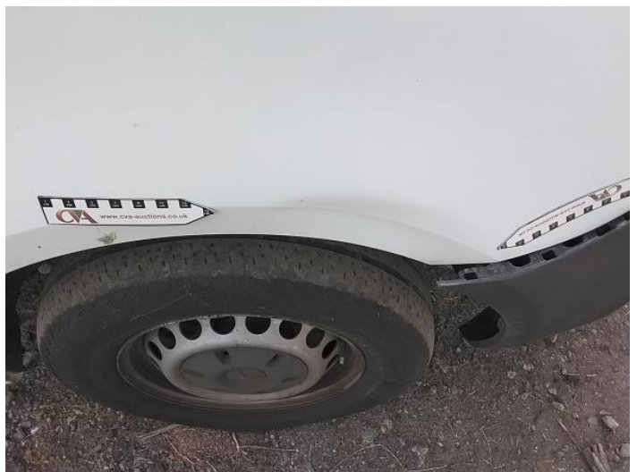
44: Wing osf Dented Over 30mm