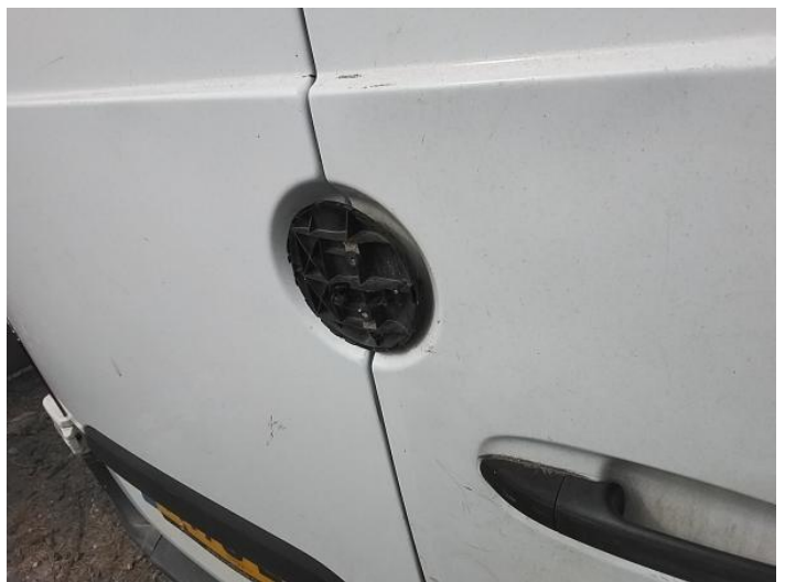
26: Badgedecal Rear Broken Replace