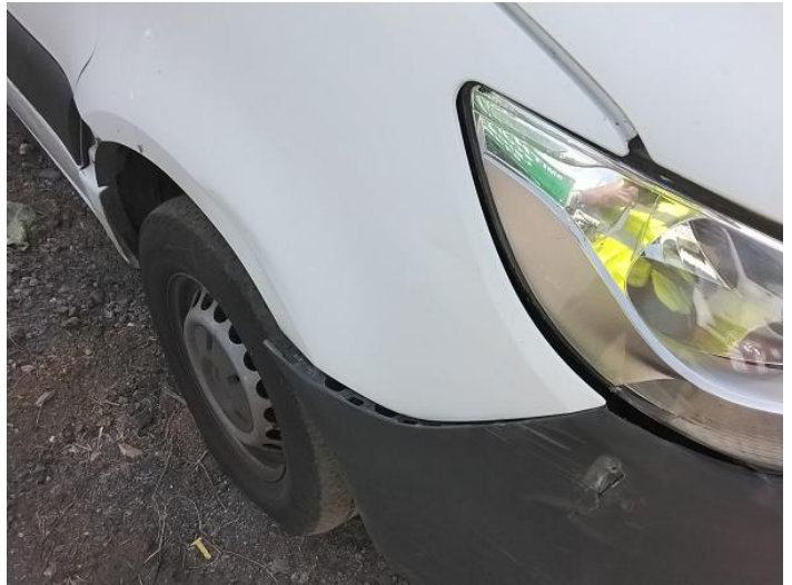
46: Wing osf Dented Over 30mm