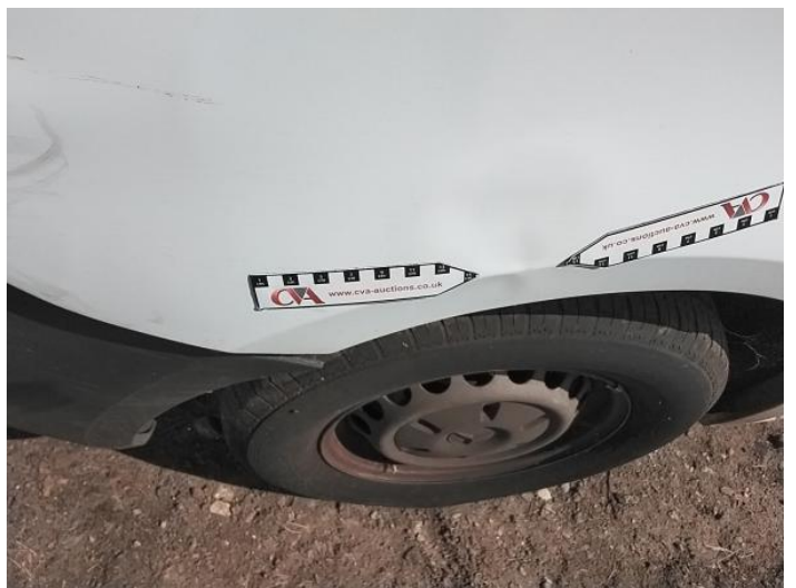
8: Wing nsf Dented Over 30mm