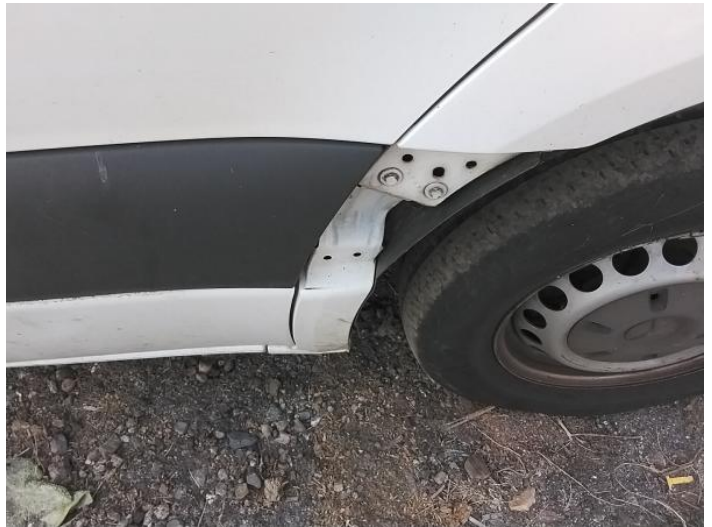
42: Door Moulding osf Missing Replace