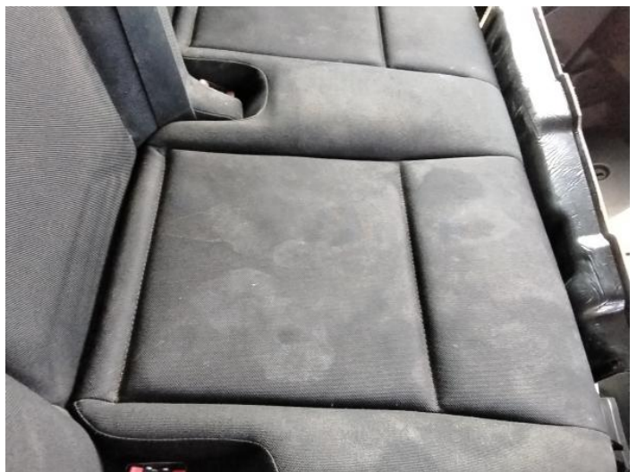
50: Seat Base Cover nsf Soiled Heavy