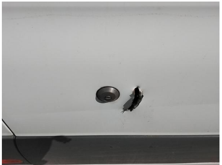
18: Qtr Panel nsr Hole Over 10mm