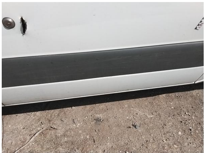
20: Qtr Panel Moulding ns Scuffed (Unpainted) Over 100mm