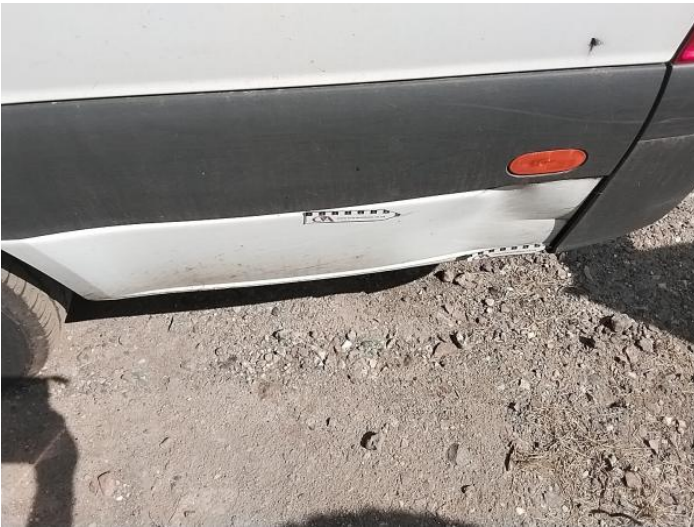
23: Qtr Panel nsr Dented Over 30mm