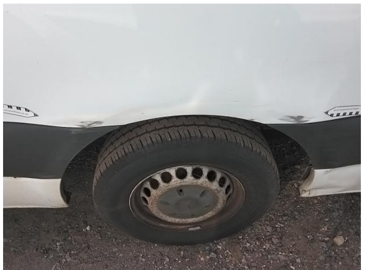
32: Qtr Panel osr Dented With Paint Damage