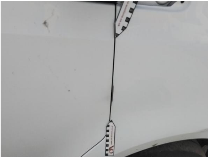
41: Door osf Dented With Paint Damage