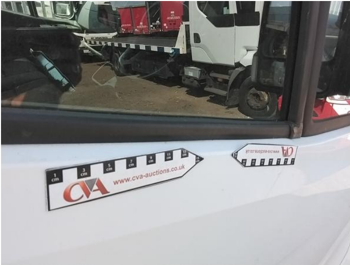
39: Door osf Dented Over 30mm