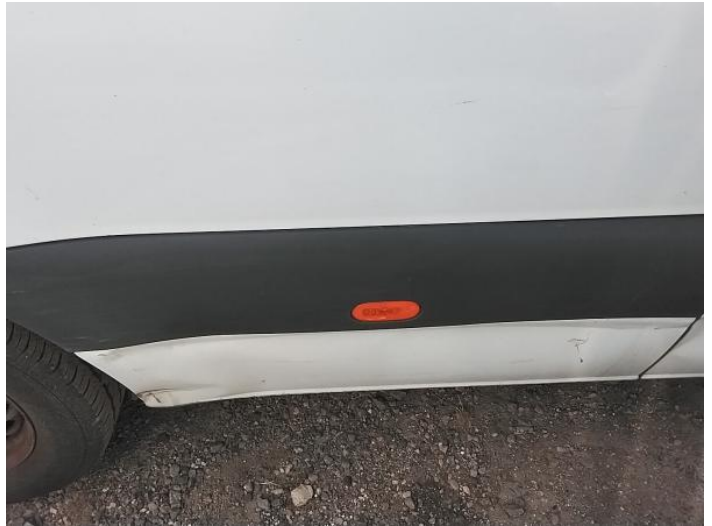
34: Qtr Panel Moulding os Scuffed (Unpainted) Over 100mm