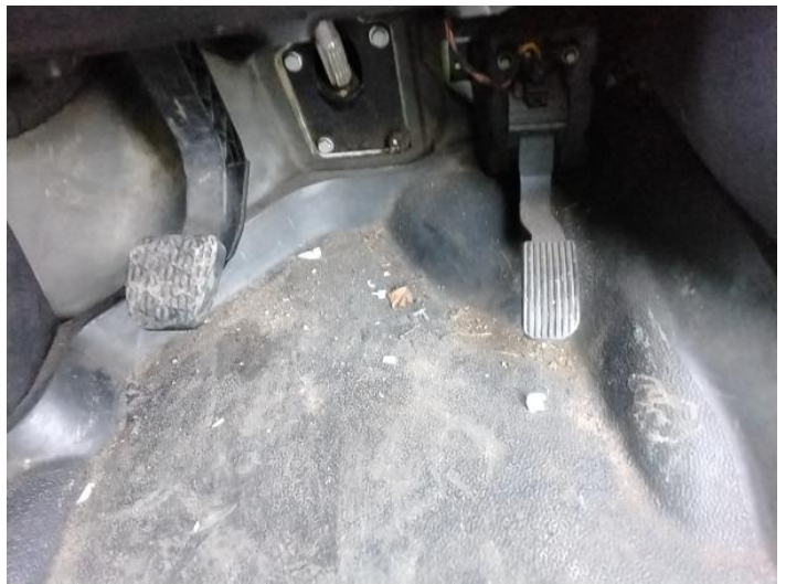
48: Switches And Controls Missing Replace