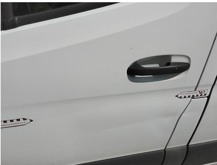
13: Door nsf Dented Over 30mm