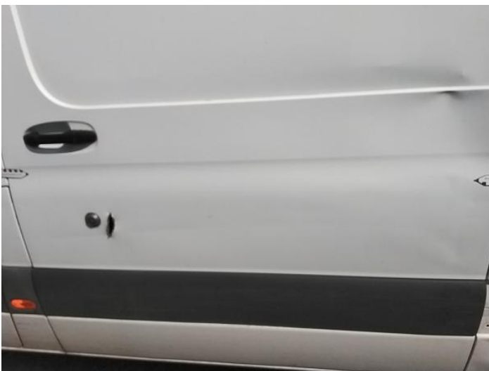
19: Qtr Panel nsr Scratched Over 25mm Thru Paint