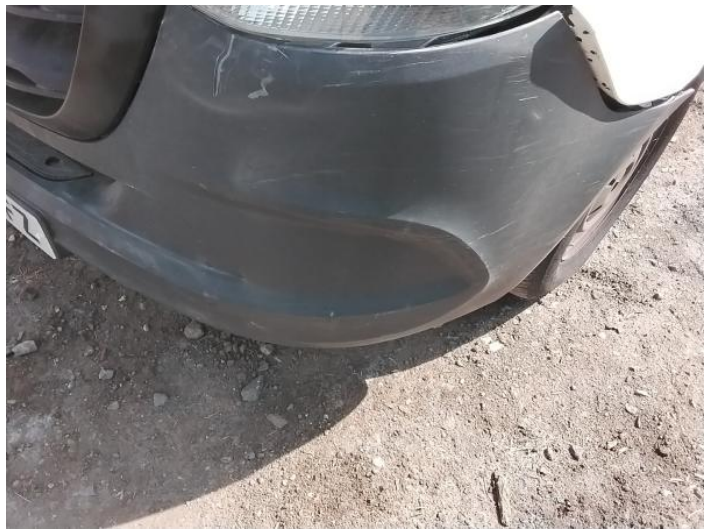
6: Bumper Front Scratched Over 100mm Thru Paint