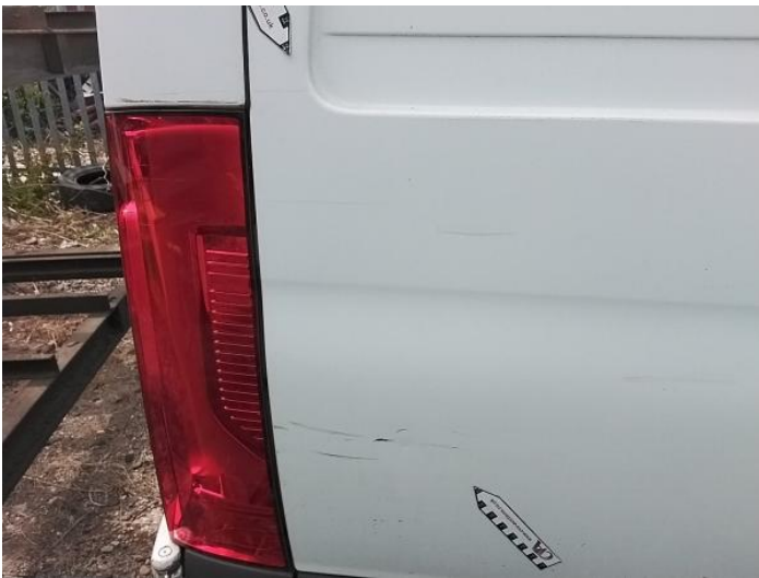
29: Qtr Panel osr Scratched Over 25mm Thru Paint