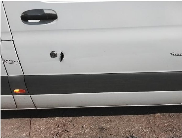
17: Qtr Panel nsr Dented Over 30mm