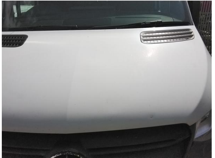
4: Bonnet Chipped Multiple Chips