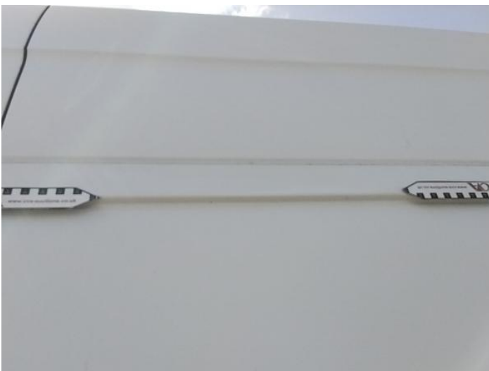
37: Qtr Panel osr Dented Over 30mm