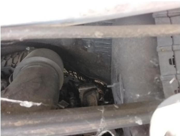
1: Unclassified Major Parts Missing Report Only