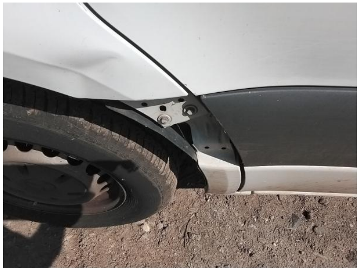
12: Door Moulding nsf Missing Replace