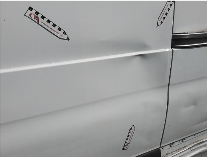
21: Qtr Panel nsr Dented Over 30mm