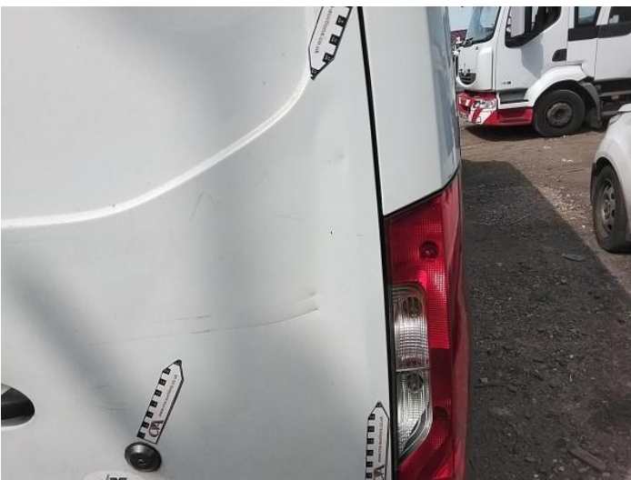
25: Door osr Dented With Paint Damage