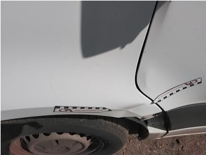
9: Wing nsf Dented Over 30mm