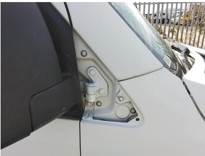
43: Door Moulding osf Missing Replace