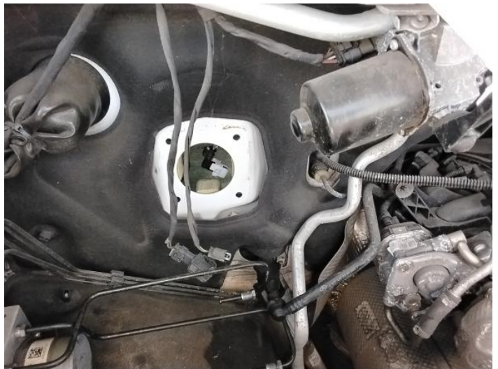
2: Unclassified Major Parts Missing Report Only