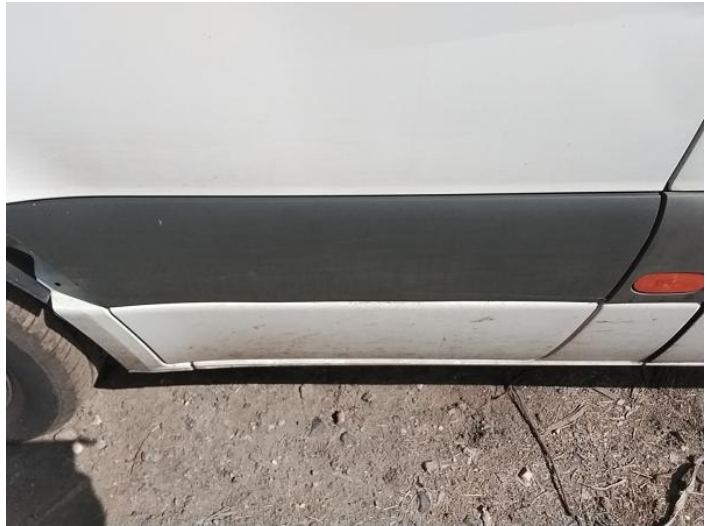
16: Door Moulding nsf Scuffed (Unpainted) Over 100mm