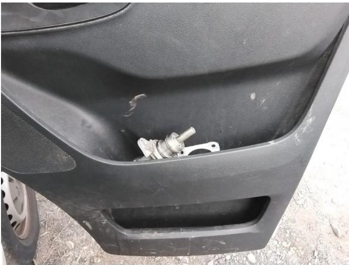
47: Door Pad osf Soiled Heavy