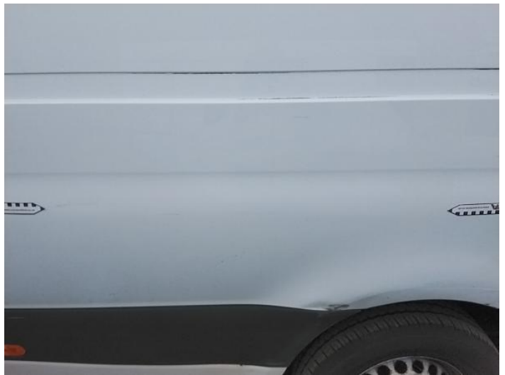
30: Qtr Panel osr Scratched Over 25mm Not Thru Paint