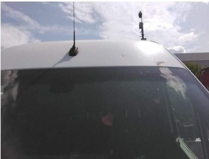
5: Roof Dented With Paint Damage