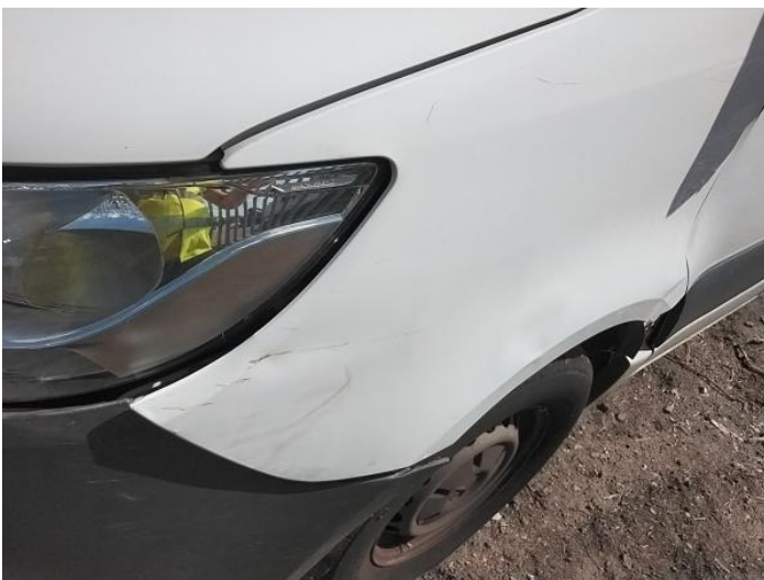
7: Wing nsf Dented With Paint Damage