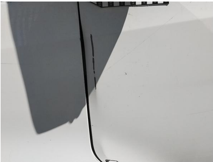
11: Door nsf Dented With Paint Damage