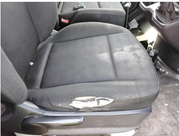
49: Seat Base Cover osf Torn Over 3mm