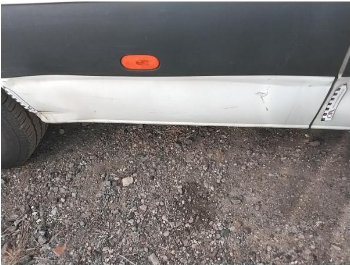
35: Qtr Panel osr Dented With Paint Damage