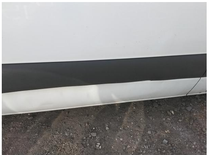
38: Qtr Panel Moulding os Broken Replace