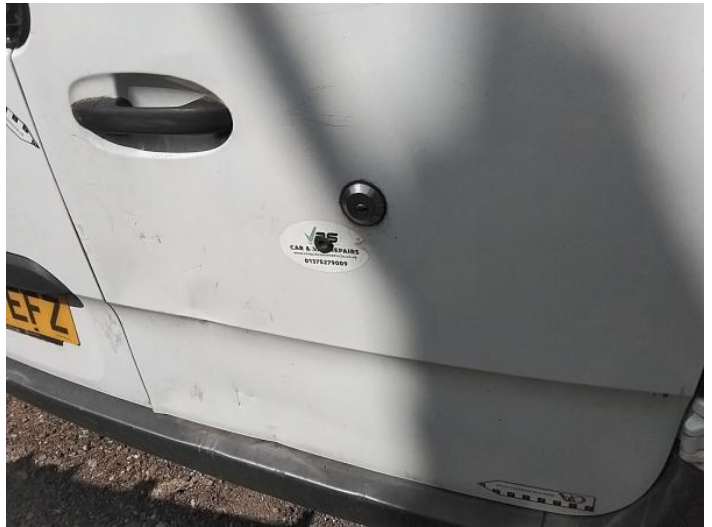
24: Door osr Dented With Paint Damage