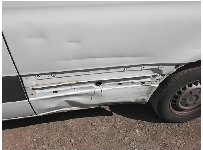
22: Unclassified Substantial Accident Damage Report Only