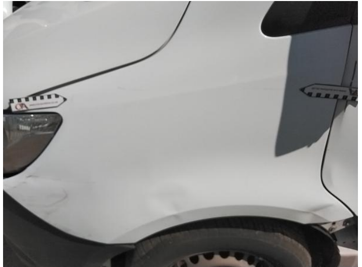
10: Wing nsf Scratched Over 25mm Thru Paint