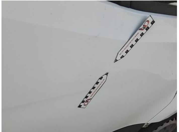
40: Door osf Dented Over 30mm