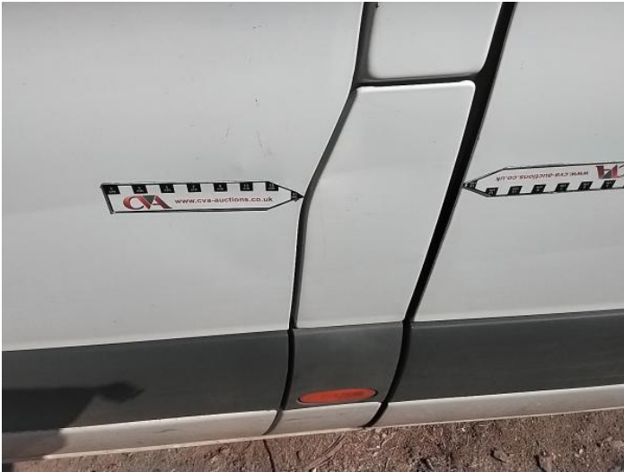
15: B Post ns Dented Over 30mm