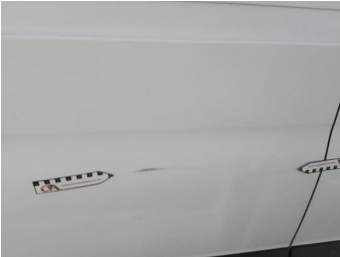
33: Qtr Panel osr Scratched Over 25mm Thru Paint