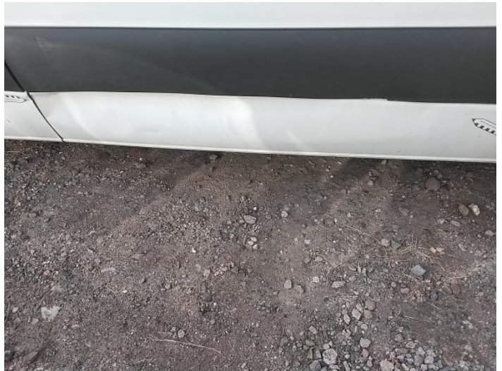
36: Qtr Panel osr Dented Over 30mm